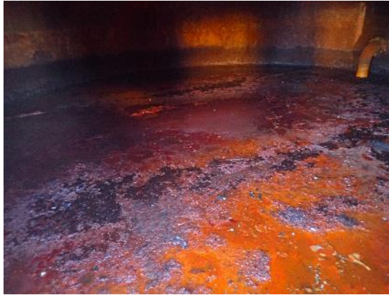
Tank prior to cleaning. Solids build up on the floor.