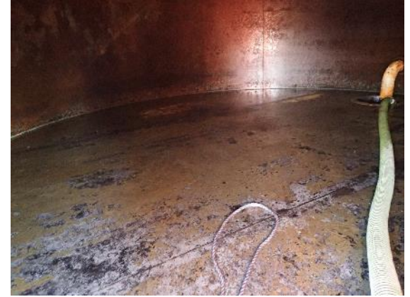
Tank cleaned and ready for blast. Some pitting on the tank floor and bottom ring.